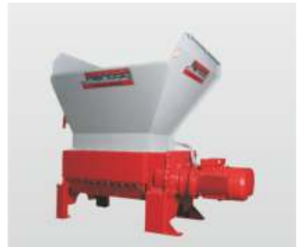
Series RMZ 500 - RMZ 1000 S: The four-shaft shredder that is ideal for shredding long stock

Drawing on its many years of experience, Reinbold, with its broad range of machines, is able to offer ideal solutions for different applications in material shredding and briquetting. Our testing facility is available to perform tests on your material.