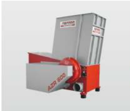
Series AZR 600 - AZR 800 S: the universal single shaft shredder for woodworking shops