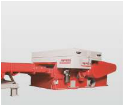
Series RLZ 400 - RHZ 1300 S: the horizontal shredder with horizontal material feed