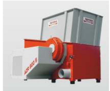
Series AZR 800 - AZR 2000 S Gigant: the single shaft shredder for professional compaction of recyclables