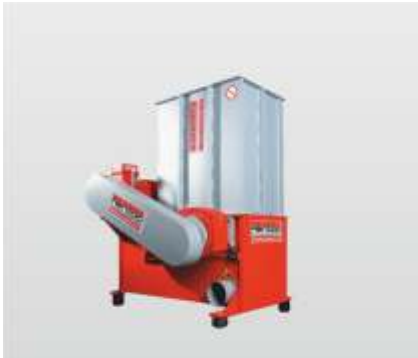
Series AZR 50 Primus: the starter model of the single-shaft shredders with drawer feed