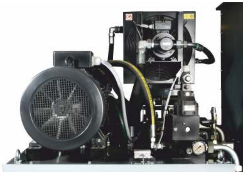
Hydraulic power unit with axial piston pump and cooling for multi-shift operation