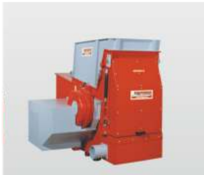
Series AZR 600 K - 2000 S K Gigant: the single shaft shredder for effective plastics shredding