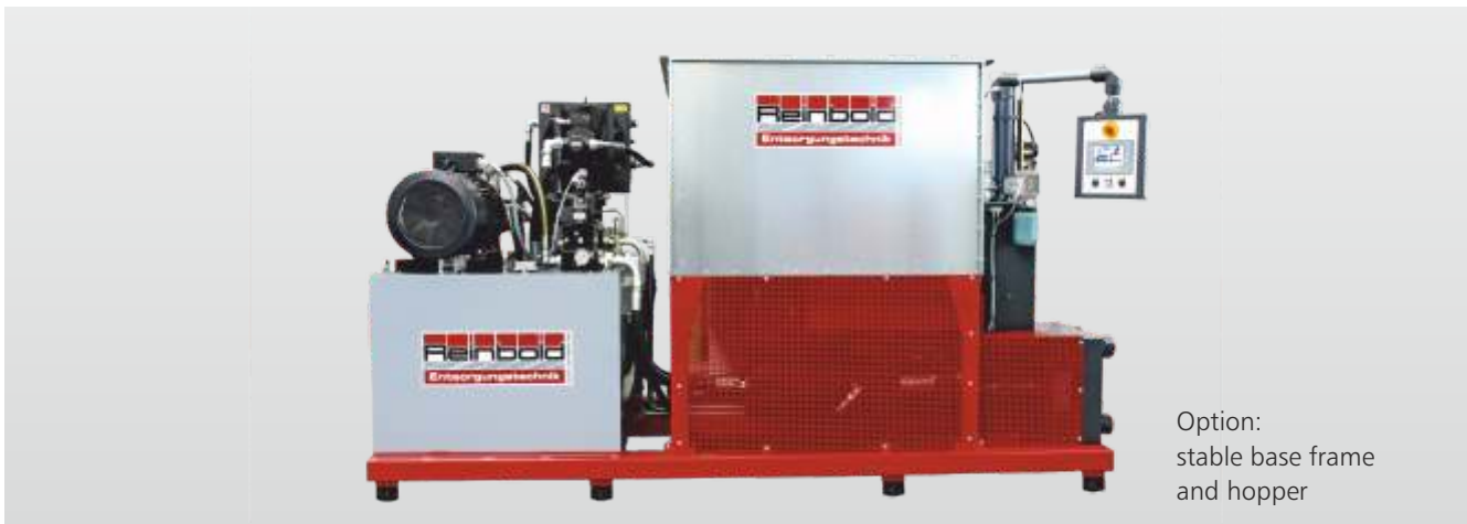
Option: stable base frame and hopper